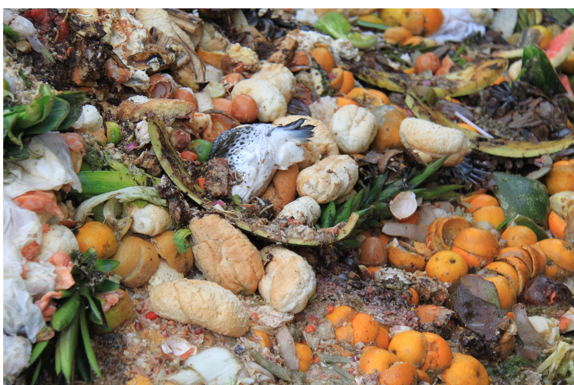
Municipal food waste in Brazil