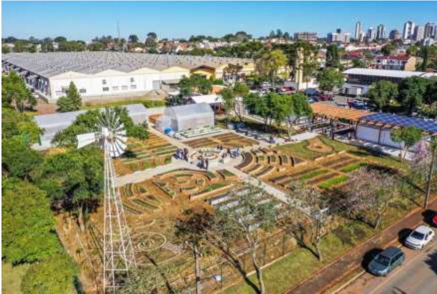
Urban farm in Curitiba (PR)