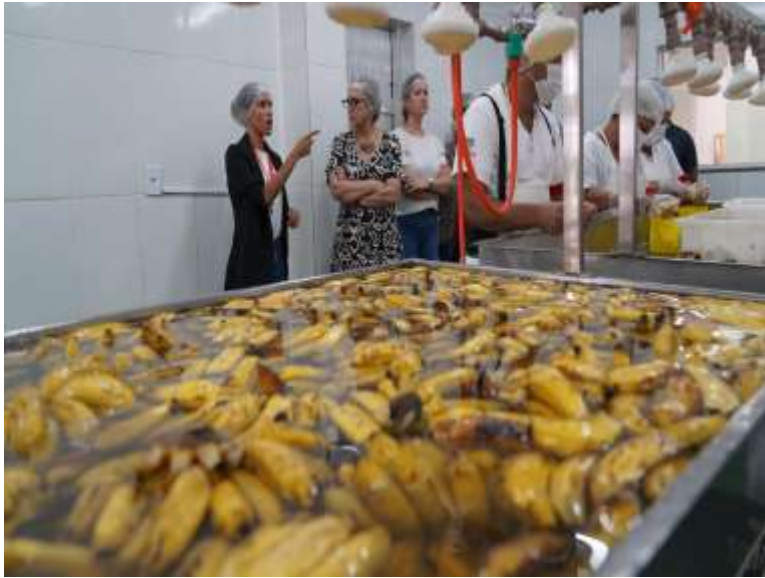
Maricá (RJ): dehydrated foods factory