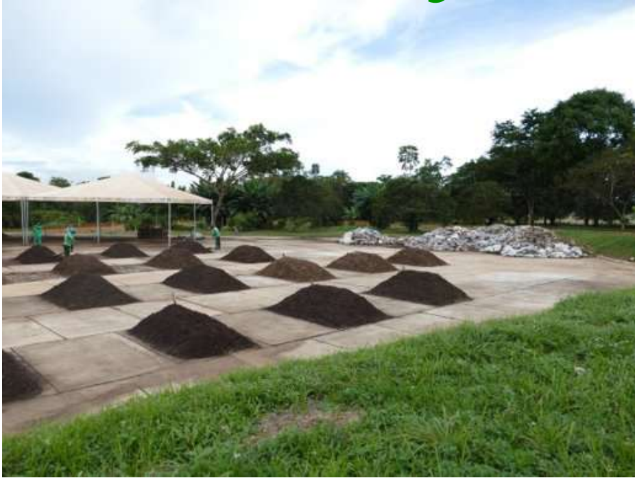
Composting unit in Rio Branco (AC)