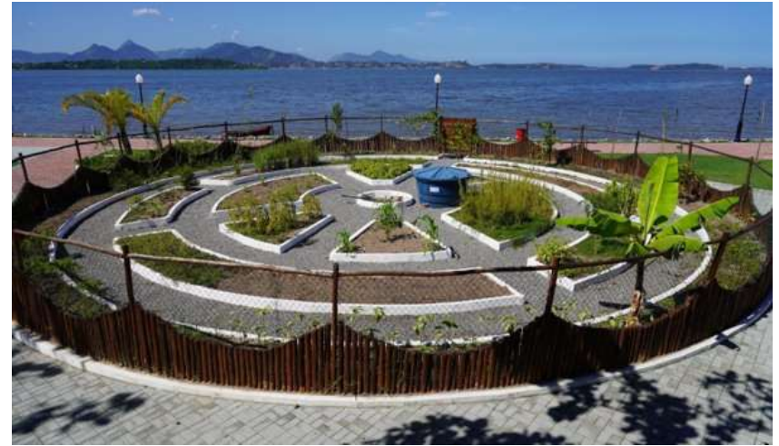
Community garden in Maricá (RJ)