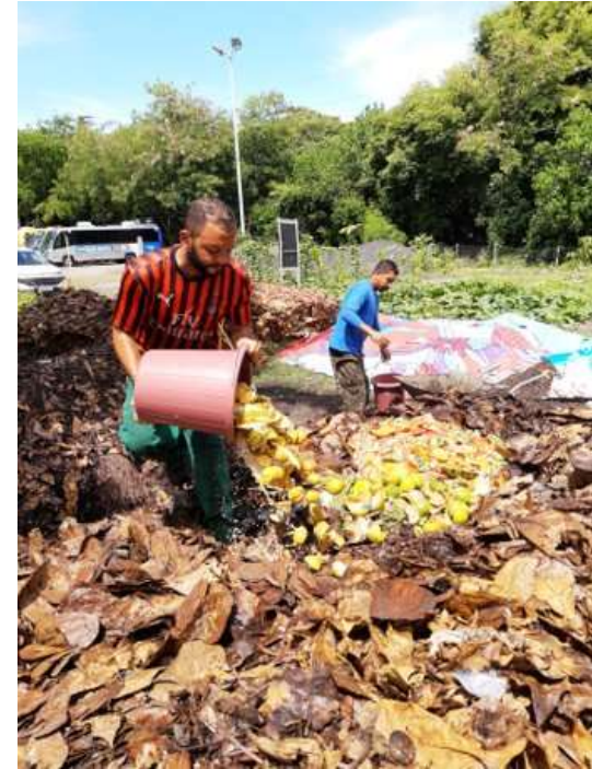
Composting in Recife (PE)