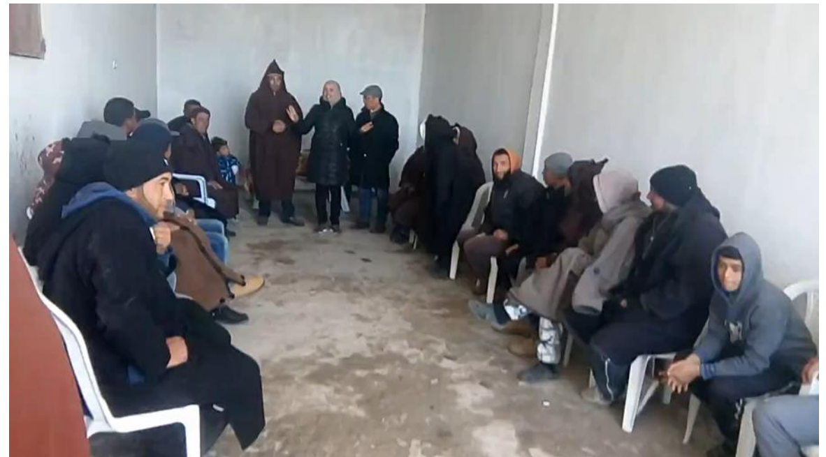
Election of local community representatives in Kef